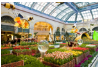
Interior of the Bellagio! Venetian Glass in the lobby

Transfer via the strip to the magnificent Bellagio.